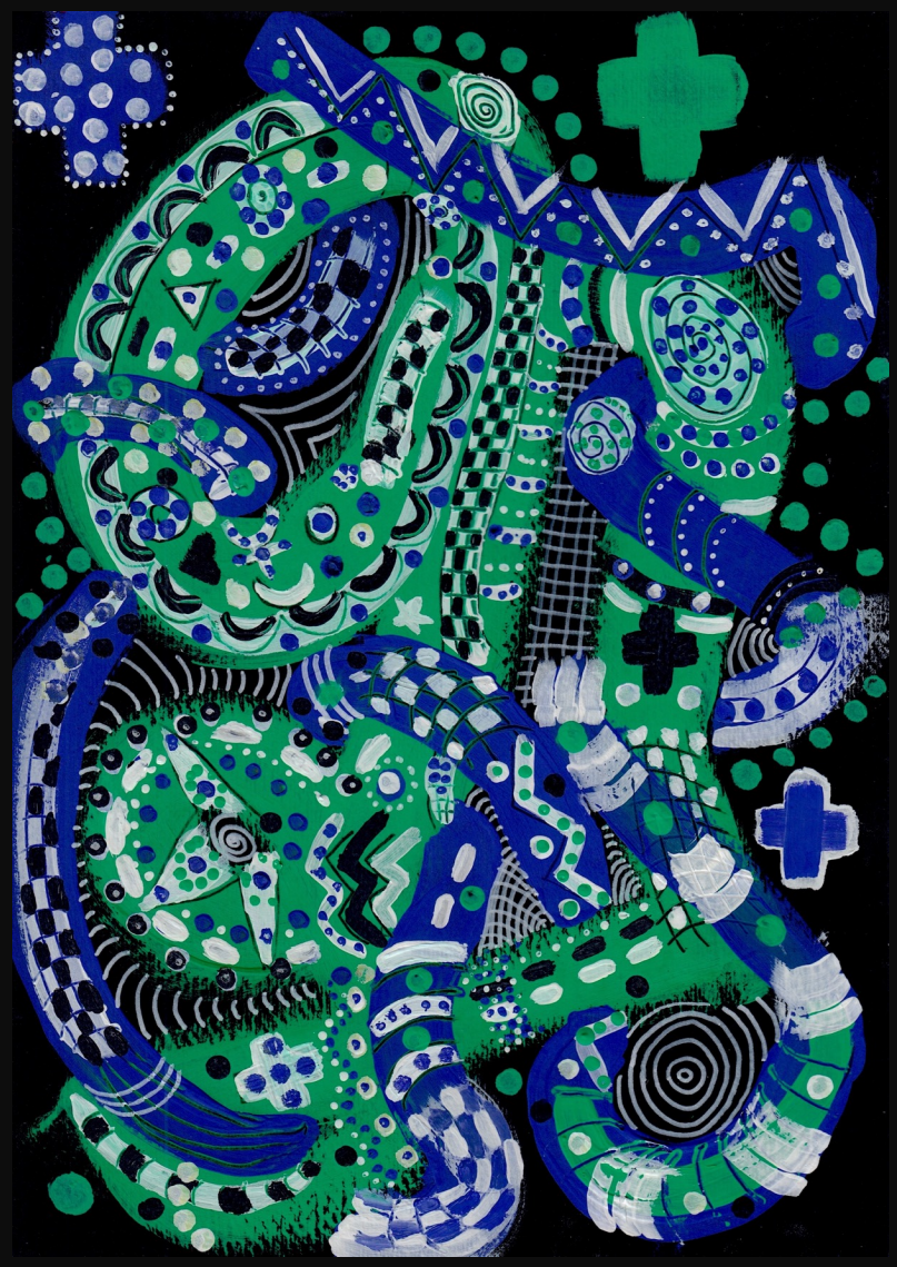
:: natural dream embracing the logical thought :: 2025 + poem