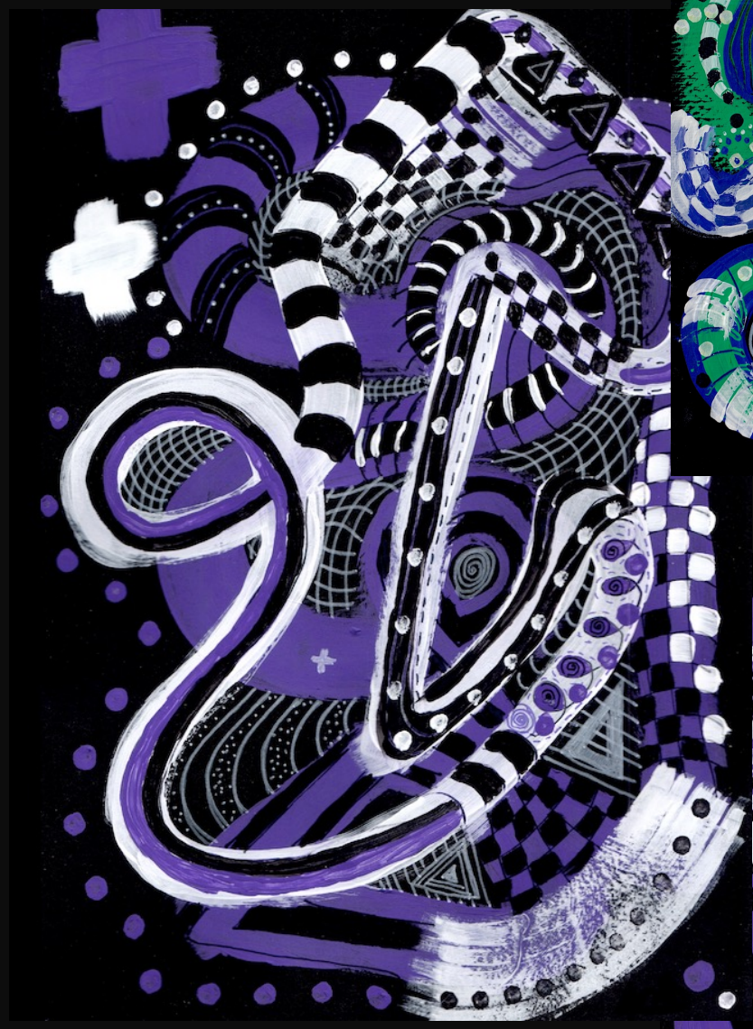
:: the divine in a human world :: 2025 + poem