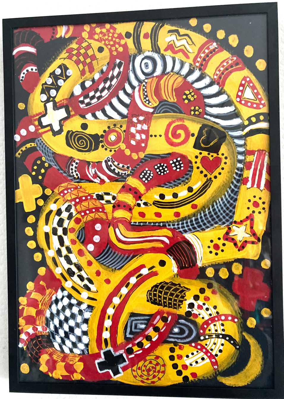
Art series :: Absurd Reality :: 2025 Gouache + pen drawing on black paper