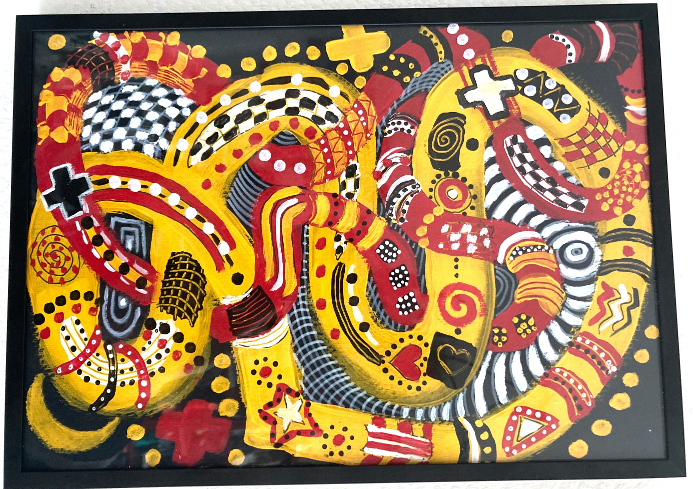
Composition of the sun covering humanity :: 2025 including a poem (not yet written)