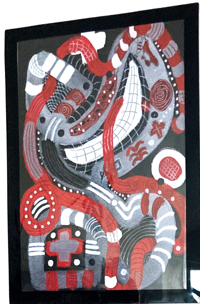
Art Series - Absurd reality Composition of war in times of love Gouache and pen on black paper, 2025

blood and love of same color in human minds red colored imagination under detonation of silver metals covered in death ancient signs of destroyed life exile as magic spells on the surface of the war matter against the will of the hypocrites warning by killing in times of love turned to blood where the weapons will sink to their end in the endless human love